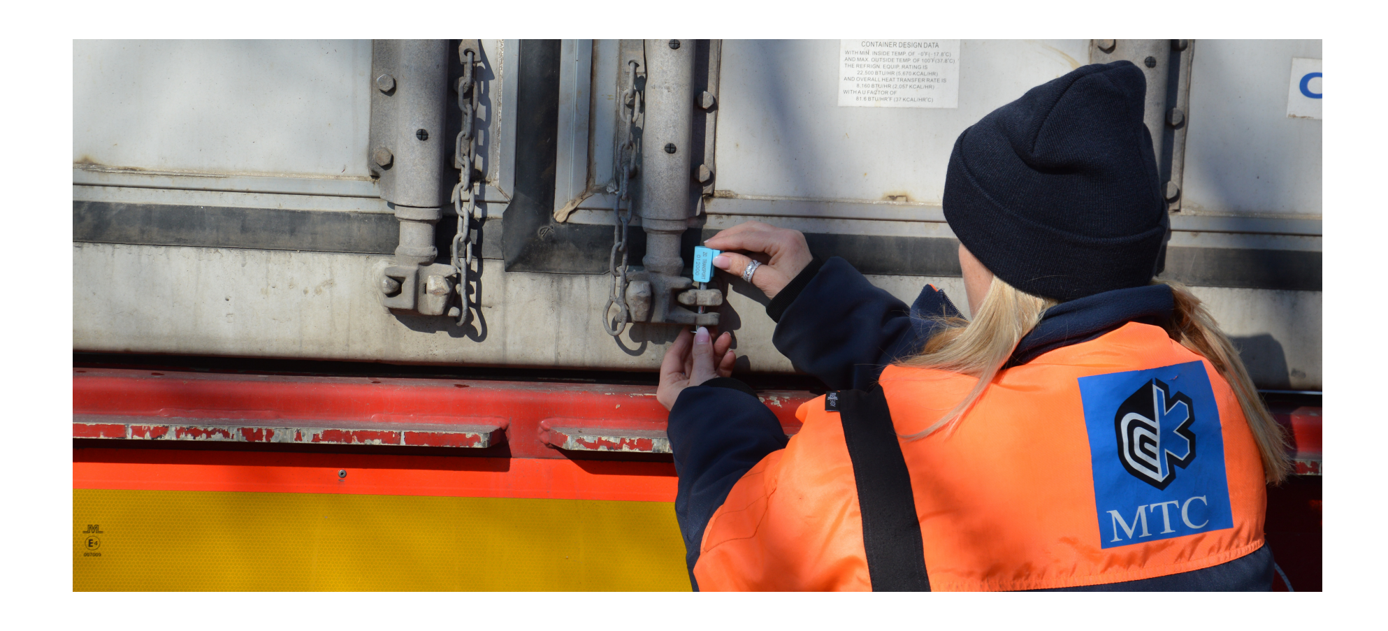
We are registered on the Japan Export List

The Japanese authorities require additional guarantees for exporting fresh pork and beef, pork products, milk and milk by-products to Japan.